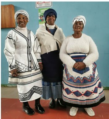
Caregivers in their traditional attire!